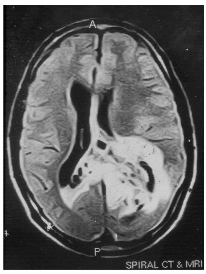
Figure I Non-contrast magnetic resonance imaging showing hyperintense lesion involving the left temporal and parieto-occipital regions. The tumor is crossing the midline to the right parietal region.

The excised tumor was sent for histological examination in the form of multiple pieces. No capsule or normal looking brain parenchyma could be identified. All the tissue submitted was processed and examined. Microscopically it was a biphasic tumor with pseudopapillary configuration (Figure 2a) and focal solid pattern (Figure 2b). The