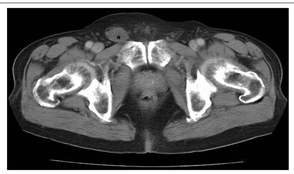
Figure 1 Contrast-enhanced CT scan on the pelvis. It reveals an oval shaped, low attenuation mass (asterisk), measuring 5.0x2.5x2.1 cm, and showing a well demarcated smooth margin in the right inguinal area.

short simple papillae supported on delicate fibrovascular stalks. The epithelium itself consisted of simple mucinous, nonciliated columnar cells with basally located small nuclei. In the most part of the epithelium, the nuclei are arranged in one or two layers. On Masson